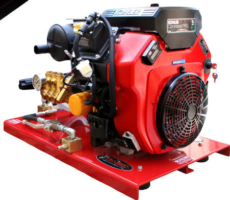
BASE PLATE SYSTEMS