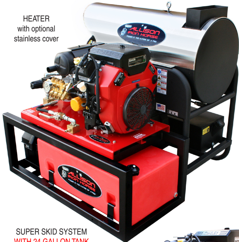
HEATER with optional stainless cover